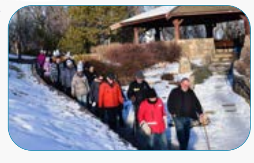
Save the Date! CNOY 2025 is scheduled for February 22, 2025

We are so grateful to our sponsors, participants and donors for showing those in our community experiencing adversity that they are not forgotten.